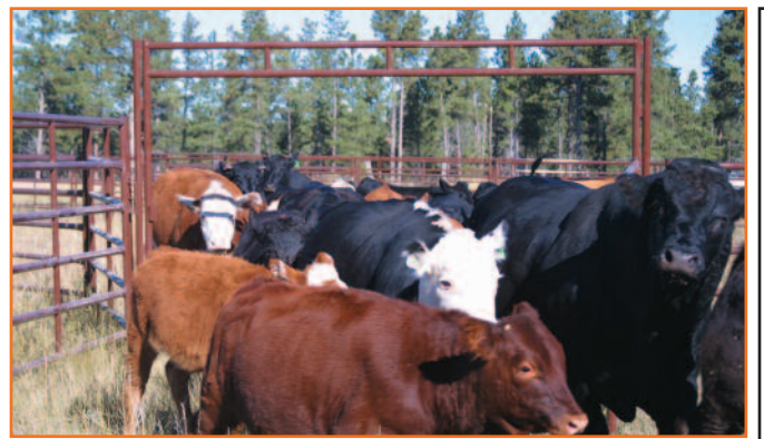
Gate opening is 10" narrower than stated gate length

Available in 5 rail: 4', 5', 8', 10', 12' 6 rail: 10', 12'