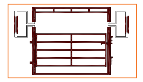
Optional 28" extension